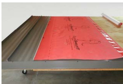
Metal roofing material should be installed immediately to each vertical run of SlopeShield