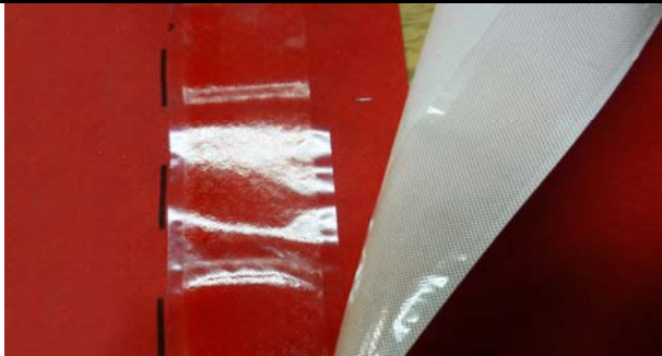
Align top membrane using dotted lap line.